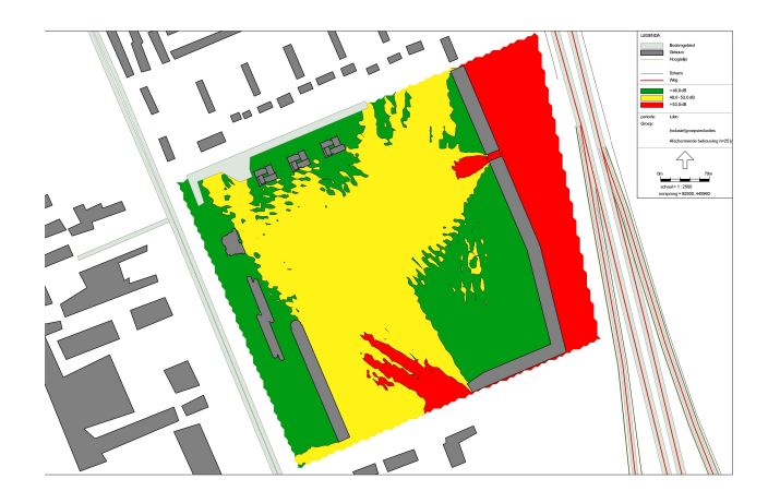
Figure 2. Example of a noise map, with buildings and calculated noise contour areas.

If an appropriate grid is defined in an area containing one or more roads, it is possible in many cases, to calculate the sound load for all immission points on this grid. Through interpolation lines of equal noise load (equi-dBcontours) can be constructed and plotted in what is called a noise map; see Figure 2.